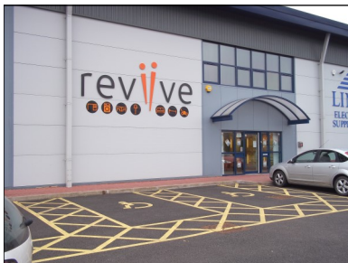
Reviive in Shrewsbury

For more information contact the team on 01584 877706.