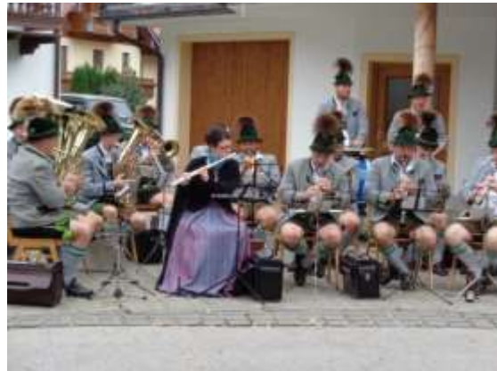
Music Festival in inzell