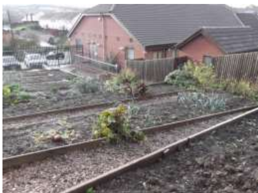
Help turn this into

We are always looking for more helpers, who don't mind getting their hands dirty, and like to work outdoors. Remember, all volunteers are entitled to a free Community Lunch, which takes place at Rockspring Community Centre every Thursday. So if you think you fit the bill and have some free time, do get in touch.