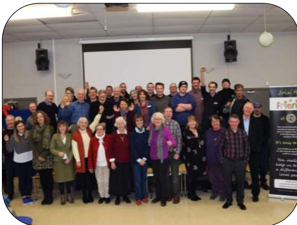
The Furniture Scheme annual celebration event—see page 6

The Furniture Scheme is multi-faceted and at the core of our activities is supporting local people and developing their full potential. At all of our facilities we provide numerous volunteer opportunities, ranging from retailing to working in our community garden. We provide a safe and caring environment where people are respected, encouraged and valued.