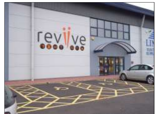
Reviive in Shrewsbury

Tel: 01743 588458 or 01743 442642 info@reviive.co.uk