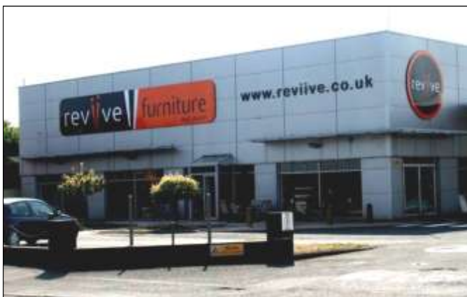
Reviive in Telford