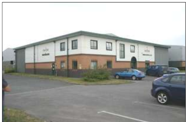
Reviive in Chester