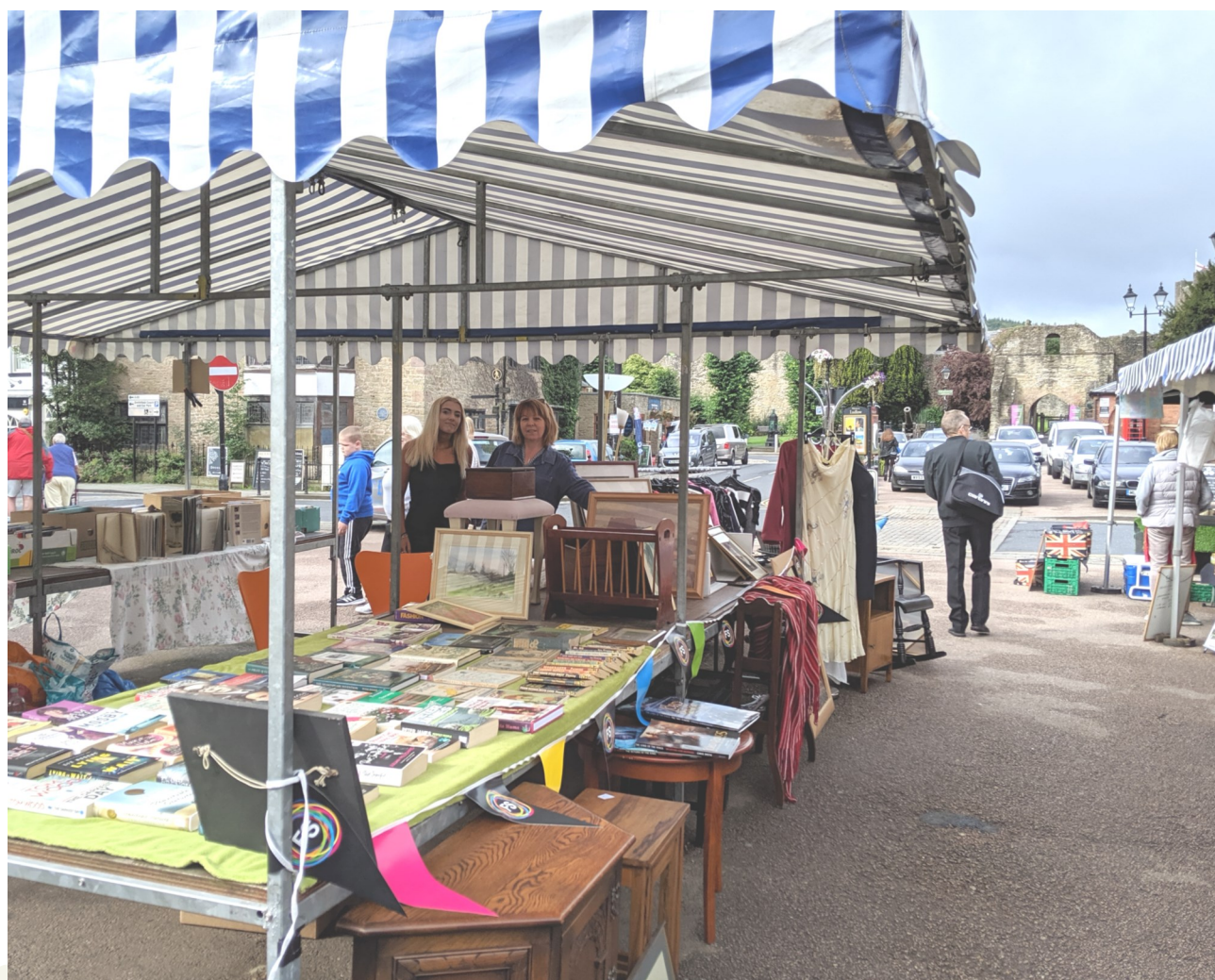
The Furniture Scheme at Ludlow Charity Market 29th August 2019 Charlotte and Julie were in charge of the stall

The Furniture Scheme is a Social Enterprise. Supporting local people and developing their full potential is at the core of our activities. At all of our facilities we provide numerous volunteer opportunities, ranging from retailing to working in our community garden. We provide a safe and caring environment where people are respected, encouraged and valued.